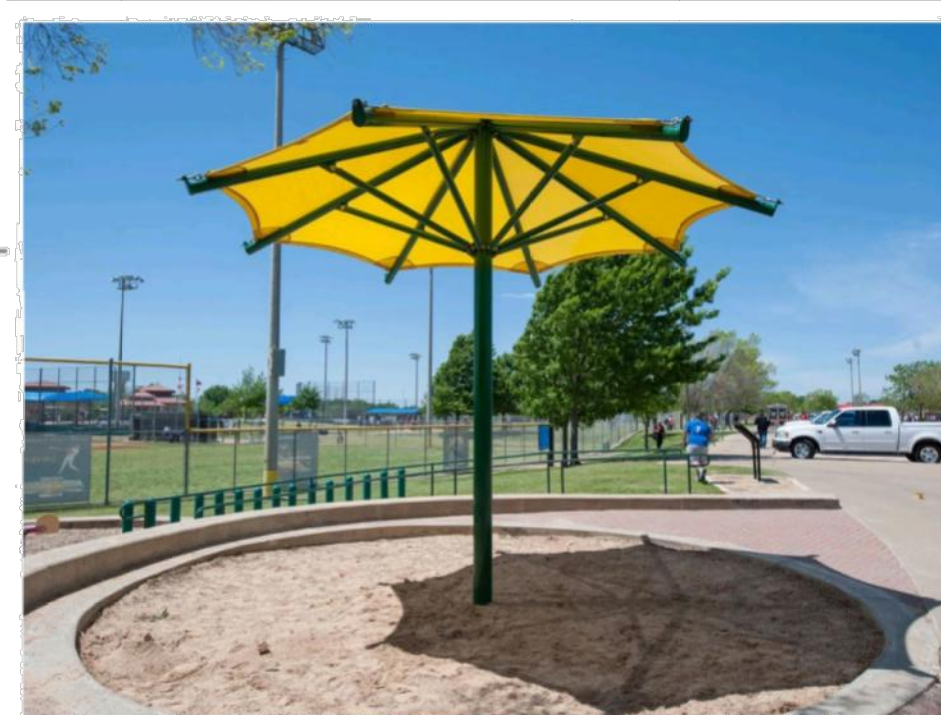
USA Shade Twilite 8-Point A modern slant on our Coolbrella design, the Twilite 8-Point structure features a single column with a 25' diameter subtly sloped roof.