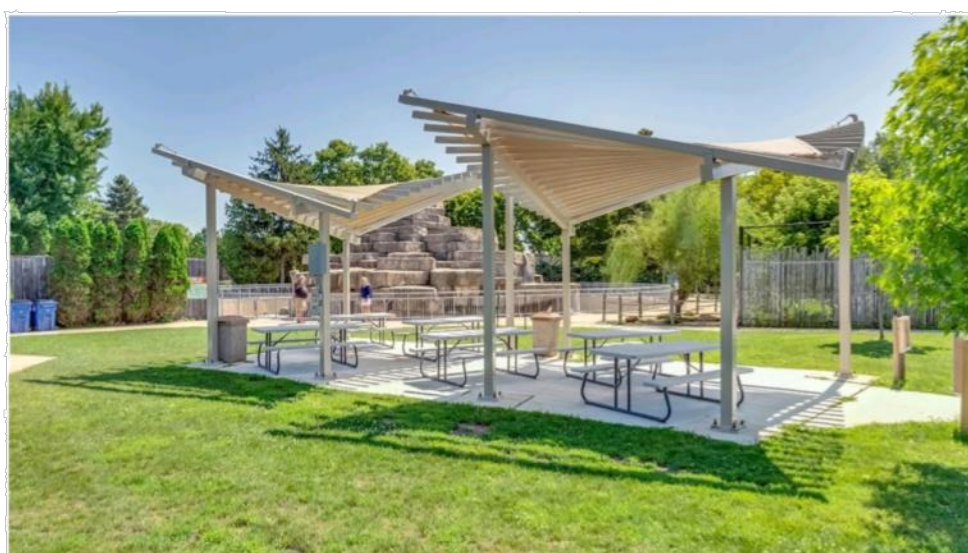
Superior Shelter Hyperbolic Trellises This picnic area consists of two hyperbolic trellises. This metal trellis has a sophisticated, elegant design that enhances the surrounding features. The distinctive design is complemented with a fully functional attached shade for additional sun protection.